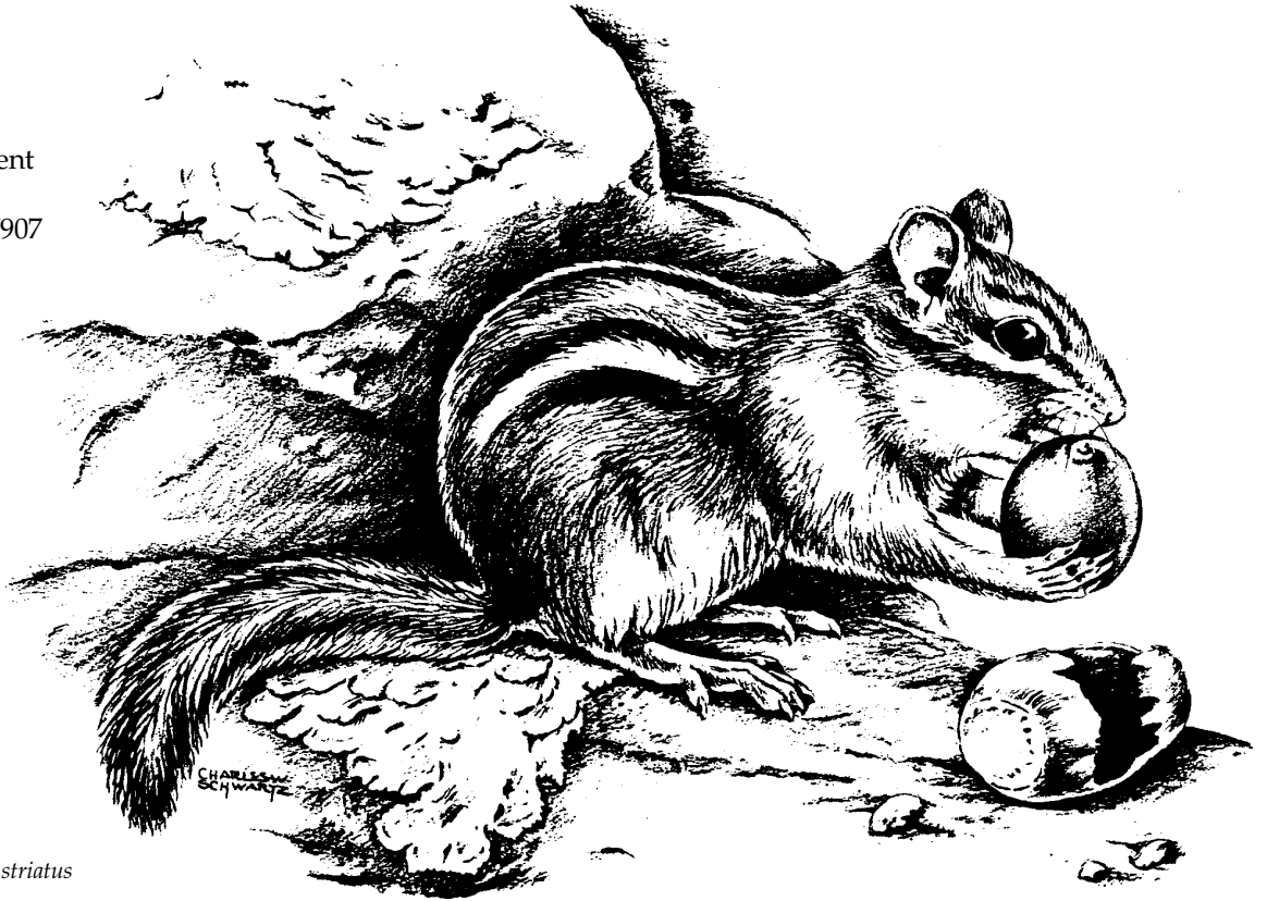
Fig. 1. Eastern chipmunk, Tamias striatus