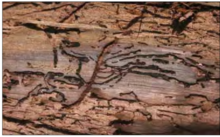
Figure 6. Walnut twig beetle galleries under the bark of a large

in diameter and 6 to 12 inches long that has visible symptoms. Please submit branch samples to your State's plant diagnostic clinic. Each State has a clinic that is part of the National Plant Diagnostic Network (NPDN). They can be found at the NPDN Web site (www.npdn. org). You may also contact your State Department of Agriculture, State Forester, or Cooperative Extension Office for assistance.