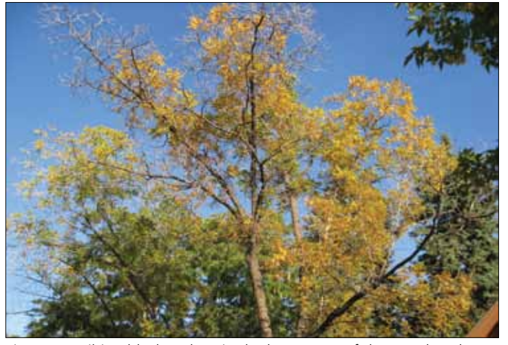
Figure 2. Wilting black walnut in the last stages of thousand cankers disease.