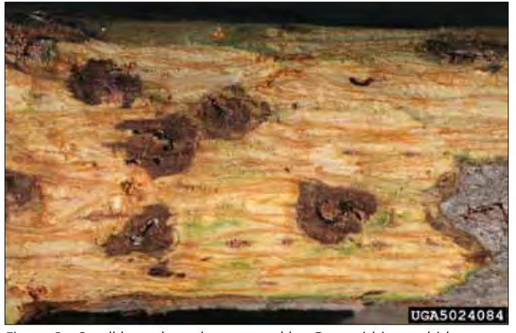
Figure 3. Small branch cankers caused by Geosmithia morbida.