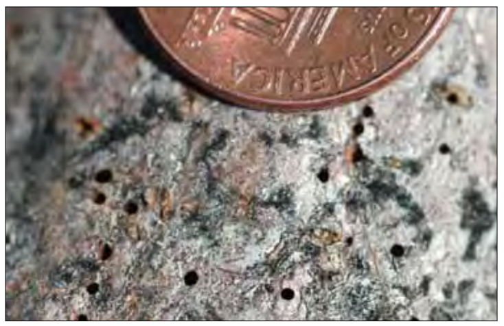
Figure 4. Exit holes made by adult walnut twig beetles.

Geosmithia morbida appears to be more virulent than related species. Aside from causing cankers, the fungus is inconspicuous. Culturing on agar media is required to confirm its identity. Adult bark beetles carry fungal spores that are then introduced into the phloem when they construct galleries. Small cankers develop around the galleries; these cankers may enlarge and coalesce to completely girdle the branch. Trees die as a result of these canker infections at each of the thousands of beetle attack sites.