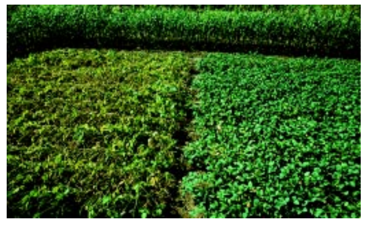
Symptoms of high infection (left) and low infection (right) levels of soybean rust within a soybean field.

Seedborne transmission has not been documented, although seed lots may contain contaminated plant debris capable of spreading the pathogen. Clouds of spores are released if infected plants are disturbed by wind or by individuals walking through rust-infected areas. Individuals who are sampling for soybean rust may transport spores from one area to another on clothing. If clothing is exposed to spores, care should be taken to prevent the spread of soybean rust to uninfected locations.