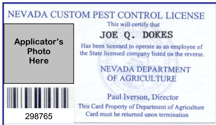
License card front