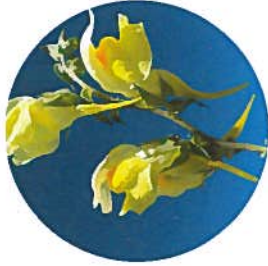
▲ Category A: Dalmatian toadflax