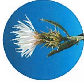
▲ Category B: Diffuse knapweed

Category C: Weeds currently established and generally widespread in many counties of the state. Abatement is at the discretion of the state quarantine officer.