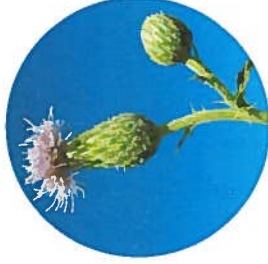
▲ Category C: Canada thistle