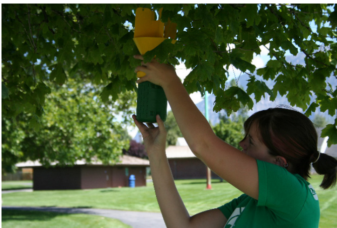
Fig. 5. Japanese beetle trap 5 .

In certain situations where persistent Japanese beetle damage is documented over multiple years, a more aggressive control program can be initiated. Set up a sex pheromone/floral lure trap (Fig. 5) to help estimate initial and peak adult emergence. The trap should catch about 75% of the beetles in that area; but be sure to place the trap on the edge of the property or away from susceptible plants (see product ordering information below).