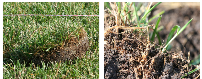
Fig. 4. Core soil sample and turfgrass root zone 5 .

Begin scouting after adult emergence to look for eggs or small instars to decide if treatment is warranted. Take at least four evenly spaced turfgrass samples for the area. Cut a 6" x 6" square on three sides with a hand trowel to examine the upper 2" of the root zone (Fig. 4). If the turf is dying and grubs are absent, examine the soil for other causes of injury, such as disease, excessive thatch, moisture stress, heat damage or other insect feeding. After looking through the soil sample, replace the soil and return the turf. During the summer, look for adults on