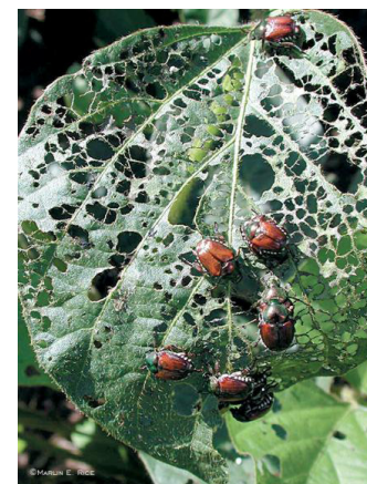
Fig. 1. Adult Japanese beetles feeding 2 .

damaged turfgrass can feel spongy and be easily pulled away from the soil surface. Drought conditions can make turfgrass injury worse.