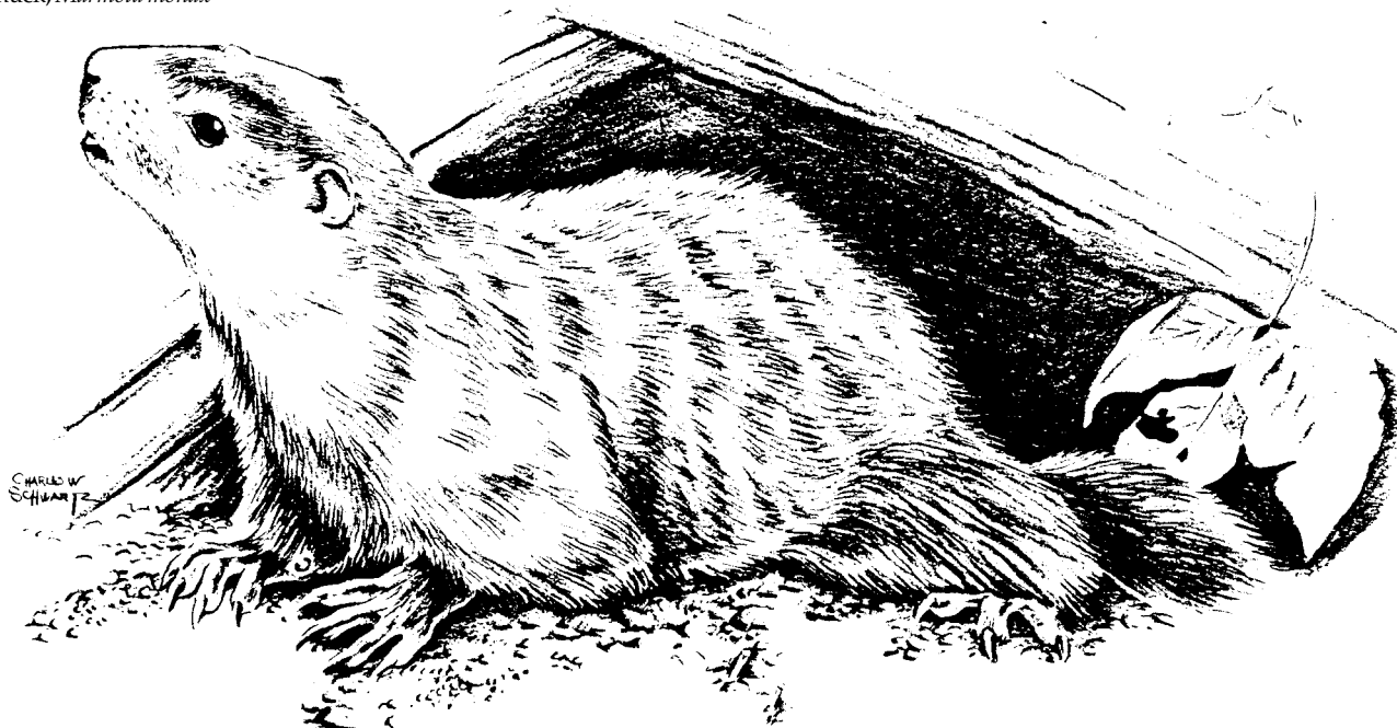
Fig. 1. Woodchuck, Marmota monax