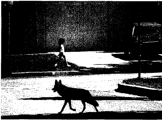
Figure 2. An urban coyote strolls through West Hills, a suburb of Los Angeles, California, in July 2002.