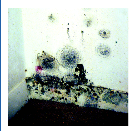
Photo 3A: Mold growing in closet as a result of condensation from room air