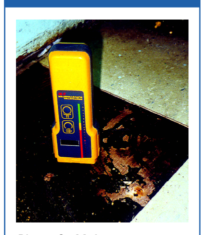
Photo 9: Moisture meter measuring moisture content of plywood subfloor