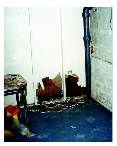
Photo 3B: Front side of wallboard looks fine, but the back side is covered with mold