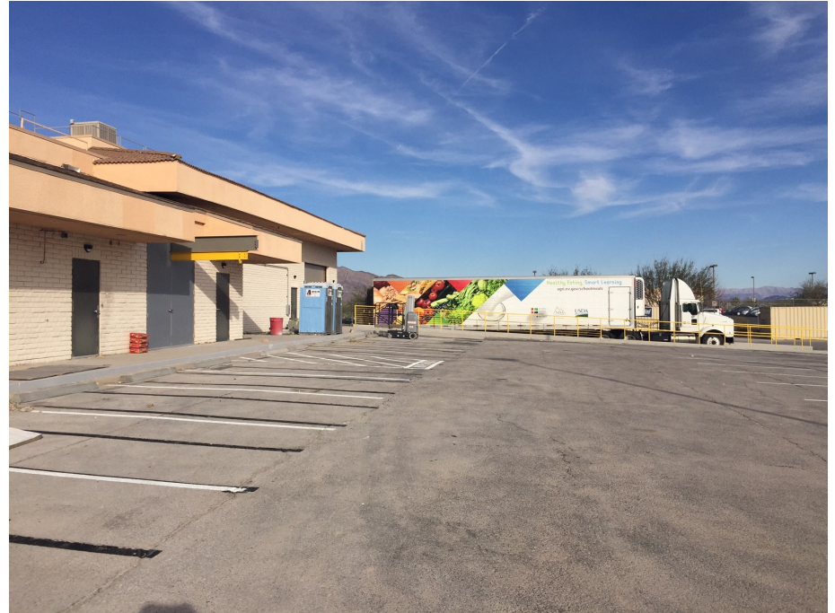
Staff and public parking