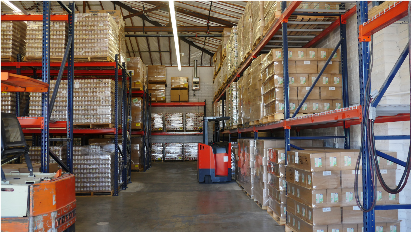
Food and Nutrition warehouse