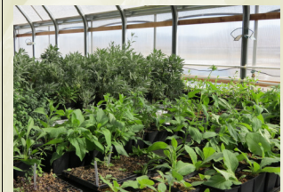
Carson City High School Green House

Carson City High School Greenhouse project will provide at least 20 students the opportunity to complete one summer school class in Greenhouse Production and Management. Class curriculum will be geared towards floriculture, cut flowers, Community Sustainable Agriculture (CSA) projects, and greenhouse production. This project will also provide 10 students, 17 years or older, stipends to complete work experience training based on their classroom training.