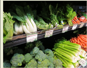
Previously Awarded project to Great Basin Food Cooperative to establish farmer recognition signage.

Practices (GAP). This project will provide assistance to farmers through cost-share and train-the trainer programs. The NDA will also continue to oversee SCBGP projects, perform outreach to program stakeholders, and ensure that Federal and State requirements are being met.