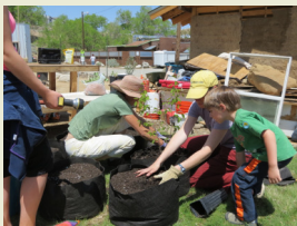
2012 Planting day at Urban Roots

The Nevada Department of Agriculture (NDA) and Nevada Cooperative Extension (NCE) are currently working on establishing a Good Agriculture Practices (GAP) and Good Handling Practices (GHP) program in Nevada. This will be a volunteer program geared towards small farm operations.