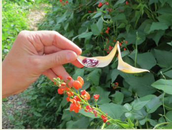
Previously awarded Friends of Nevada Organics and Urban Roots, Blueberries/beans research project .

The University of Nevada, Las Vegas (UNLV) will develop and implement a pilot horticulture education project for youth (grades 9-12). Students will develop specialty crop production and marketing skills during this project.