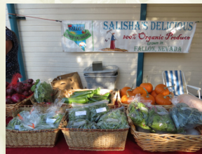
Produce from Fallon Small Farm Collaborative in Sparks, NV

equipment, increasing the availability of specialty crop products. CEDA was one of four projects, highlighted in USDA's 2012 Blog! http://blogs.usda.gov/2012/10/01/specialty-crop-grants-make-a-difference-for-farmers-and-businesses/ .