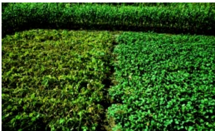
Symptoms of high infection (left) and low infection (right) levels of soybean rust within a soybean field.

Seedborne transmission has not been documented, although seed lots may contain contaminated plant debris capable of spreading the pathogen. Clouds of spores are released if infected plants are disturbed by wind or by individuals walking through rust-infected areas. Individuals who are sampling for soybean rust may transport spores from one area to another on clothing. If clothing is exposed to spores, care should be taken to prevent the spread of soybean rust to uninfected locations.