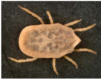
( Ornithodoros sp. by CDC)