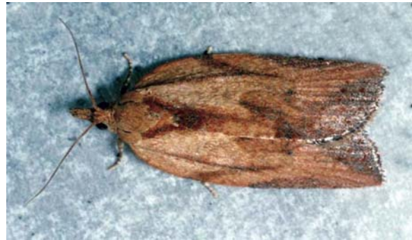
Image P1030

LBAM feeding can damage or kill seedlings and affect the appearance of ornamental plants. It attacks many important orchard and field crops, including apples, blueberries, cherries,