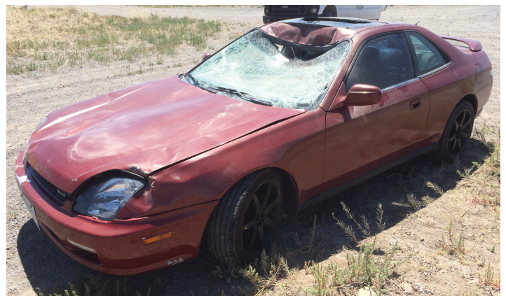
The aftermath of a horse-vehicle collision.

No general fund money currently is allocated for the management of feral or stray livestock. Fees paid by Nevada livestock producers help support the NDA's agriculture enforcement officers, which include activities and equipment associated with the Virginia Range horses.