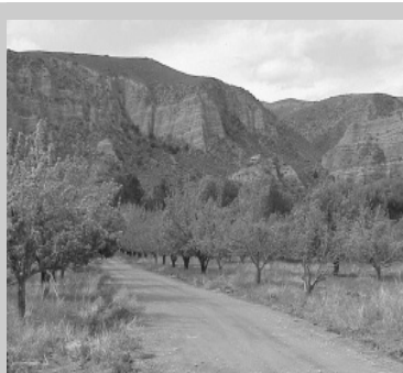
Bradshaw's End of the Rainbow Apple Orchard is located in Beautiful Rainbow Canyon