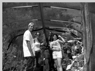
Rainshadow students show off their bountiful harvest at the hoop-house.