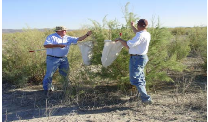
Collecting saltcedar leaf beetles

In 2006, the Red Imported Fire Ant (IFA) ( Solenopsis invicta ) was surveyed for in two Nevada counties. Trapping and data collection were performed by three full time NDOA seasonal employees in the southern part of the state, and one part time NDOA seasonal in the northern area. 8,903 traps were placed at over 300 sites. All were negative for fire ants. The University of Nevada- Las Vegas campus was found to be free of imported fire ants after four years of treatments. There are currently no areas in Nevada being treated for imported fire ants.