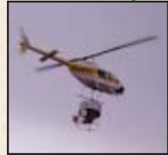
Aerial fire rehabilitation seeding.