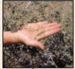
Seeds of antelope bitterbrush.

AOSCA has implemented certification requirements and standards that accommodate plant germplasm (whether newly acquired accessions or named varieties) of native grasses, forbs, and woody plants. These certification procedures provide third-party verification of source, genetic identity, and genetic purity of wildland collected or field or nursery grown plant germplasm materials. This bulletin defines AOSCA plant germplasm types, describes certification procedures and labeling, and summarizes supporting guidelines, tables, and flow charts.