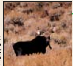
Native collector in mountain big sagebrush stand.