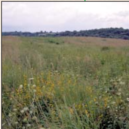
Prairie restoration project.