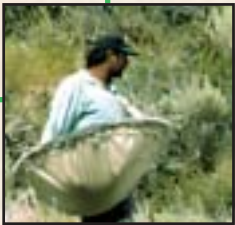
Collecting antelope bitterbrush with seed hopper.

For some broadly adapted species characterized by copious seed production, wildland collection can supply a significant seed volume for direct plantings. For most species, however, accessions consisting of limited quantities of seed obtained from defined wildland stands must be increased in fields or nurseries. Unfortunately, accurate documentation of collection site and/or cultivated production has often been unavailable to those seeking site-appropriate native plant materials. This situation led to the expansion of AOSCA third-party inspection and labeling programs to specifically address the needs of the native seed and plant industry.