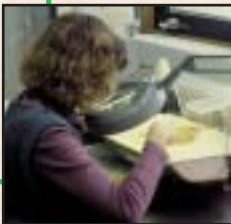
Wildland seed analysis.

Natural-track wildland collected seed is by definition Generation zero (G0) since it is an unrestricted representation of an intact G0 parent population. For a manipulated-track germplasm the G0 parent plants, which by convention for cultivated populations produce G1 seed, must be formally defined by the developer in consultation with an AOSCA agency. As shown in the pre-variety germplasm class boxes in Fig. 1, generations are designated G0, G1, G2, G3, etc., which are analogous to the variety/cultivar generation designations of Breeder, Foundation, Registered and Certified.