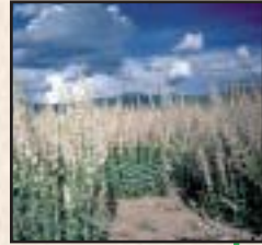
Palmer penstemon, seed field production.

Variety/cultivar tags (Breeder, Foundation, and Registered are similar in format to the Certified example shown in Fig. 2) provide little information beyond kind (species), variety name, and certification/lot number, since the formal release notice would supply pertinent variety source and development information. It is recommended, however, that “natural-track” status (if applicable) and known regions or zones of adaptation be listed on the tag for native plant varieties/cultivars.