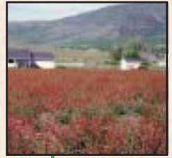
Firecracker penstemon, seed field production.

Germplasm assigned to either track follows a similar progression relative to AOSCA germplasm types, and is appropriate for end use depending on the objectives for the planting site. To facilitate this germplasm status distinction, “natural-track” recognition as applicable to a specific germplasm should be so noted on certification (see Additional Label Information section).