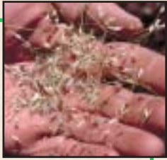
Indian ricegrass seed.

having been selected either within or as a common site comparison among accessions or populations of the same species), and (3) Tested Class (germplasm for which progeny testing has proven desirable traits to be heritable). This progression may also serve as a route leading to formal (4) Variety/Cultivar release if eligibility requirements are satisfied.