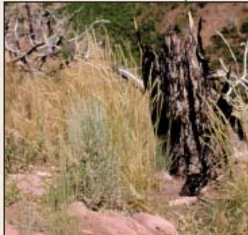
Fire rehabilitation seeding success.