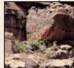
Firecracker penstemon, wildland site.

As an alternative to formal variety release, AOSCA Pre-Variety Germplasm (PVG) categories facilitate orderly procurement, production, and distribution of plant germplasm materials. The PVG categories offer a parallel progression with the first three above numbered stages for variety development. They are respectively designated as (1) Source Identified Class (unevaluated germplasm identified only as to species and location of the wild growing parents), (2) Selected Class (germplasm showing promise of desirable traits,