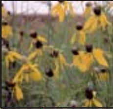
Grayhead prairie coneflower.

The number of field or nursery increase generations allowed (as well as length of stand, isolation distances required, and seed purity and viability standards) for all germplasm types may be specified by AOSCA. Factors considered are the mode of reproduction, genetic stability, plant longevity, and seed characteristics of individual species. The AOSCA generation limit for sexually reproduced or apomictic Pre-Variety Germplasm is five (unless otherwise specified), while vegetative generations may be unlimited.