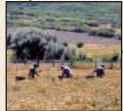
Western yarrow, seed field production.

A germplasm accession may potentially be shepherded through PVG categories on either genetic track to achieve formal release. For most native plant accessions, however, germplasm evaluation and comparison are designed to facilitate native plant use in localized site revegetation rather than for advancement toward formal release. In this context, a germplasm designation within any PVG category (Source identified, Selected, or Tested) is a legitimate end product. Many public and private agencies follow internally established protocols for germplasm acquisition, study, development, and/or release, though such formality is not a basic requirement in utilizing PVG certification. Germplasm eligibility for a given PVG category must be supported by documentation submitted to and accepted by an AOSCA seed certification agency.