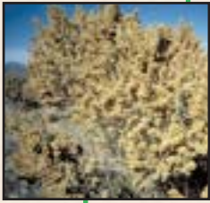
Fourwing saltbush mature seed.

Accessions that are purposefully or inadvertently hybridized with other accessions or selected for distinctive traits within the population (whether on the original site or in succeeding field or nursery generations) are routed to the manipulated-track. This routing is further illustrated by the center arrow portion of Fig. 1. If a germplasm following either track or at any stage of development is altered from its defined genetic identity, it reverts to bulk population status until granted approval as a newly defined germplasm on the manipulated-track.