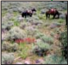
Wasatch Mountain Range wildlands.

The reproductive materials required to satisfy these planting needs have some special constraints. Most plant species consist of more or less continuous genotypic arrays reflecting differential adaptation to variation in soils, climates, and disturbance regimes across a species' range of distribution. Long-term success in restoring a species to a given site is dependent upon obtaining adapted plant materials. Adapted plant materials are most likely to originate from the same site or nearby sites with similar physical and biological environments, unless the species' population is known to be broadly adapted or particular accessions have proven to be widely adapted within the species' range of distribution.