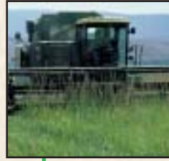
Harvesting basin wildrye.