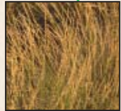
Bluebunch Wheatgrass seed heads.

As an alternative to formal variety release, AOSCA Pre-Variety Germplasm (PVG) categories facilitate orderly procurement, production, and distribution of plant germplasm materials. The PVG categories offer a parallel progression with the first three above numbered stages for variety development. They are respectively designated as (1) Source Identified Class (unevaluated germplasm identified only as to species and location of the wild growing parents), (2) Selected Class (germplasm showing promise of desirable traits,