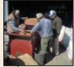
Conditioning wildland shrub seed.

Formal variety release is applicable when geographic adaptability and market potential are well defined, and is necessary when seeking protection under the Plant Variety Protection Act. Utilization of PVG categories is applicable when a) identification and propagation of species and/or ecotypes at various stages of evaluation are needed for timely (often immediate) restoration of specific geographic areas, b) market potential is limited beyond specific geographic areas, and/or c) accommodating consumer special plant material demands (refer to both sidebars in Fig. 1).