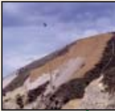
Road cut stabilization and restoration.

Large-scale natural and human-caused ecosystem disturbances generate a voluminous demand for native plant reproductive materials (most commonly seed) intended for restoration, revegetation, and stabilization of natural communities. This demand is enhanced by an increasing interest in establishing populations of native wildflowers, grasses, trees, and shrubs in parks, wildlife refuges, roadsides, tree farms and orchards, and residential landscapes.