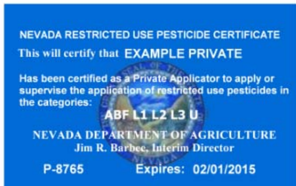
Private Applicator front