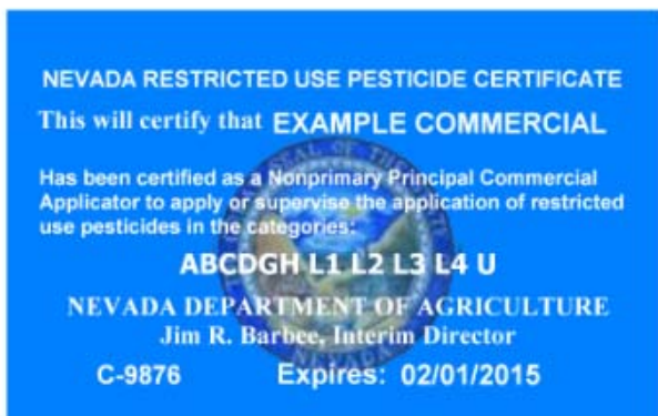
Non-primary Principal Commercial Applicator front